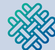
Ngā taiohi nō ngā hapori mātāwaka (otirā ngā rerenga o mua me ngā kaiheke o nā tata nei)