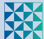
Taiohi o Te Moananui-a-Kiwa