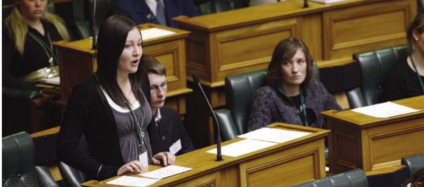
Action at Youth Parliament 2007.