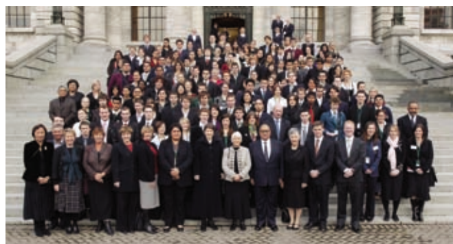
MPs and participants of Youth Parliament 2007.

The final topics will be announced by the Minister of Youth Affairs in April 2010.