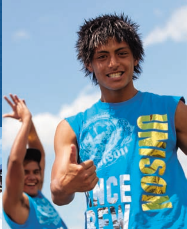
Action from the final day of the Prime Minister's Youth Programme.