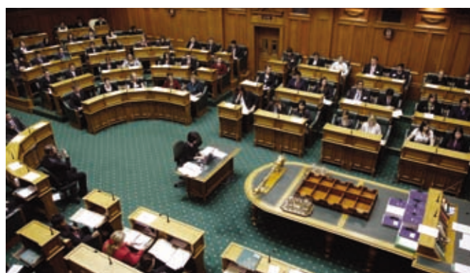
In the debating chamber during Youth Parliament 2007.